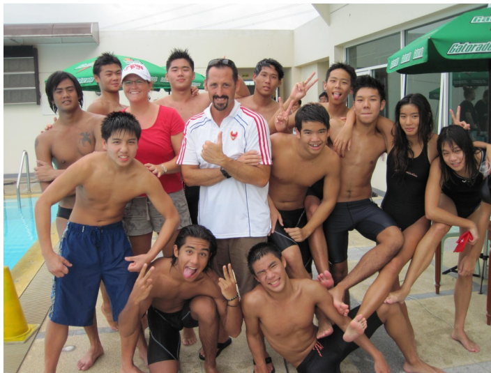
Phoenix Aquatics BISAC Water Polo Team 2011