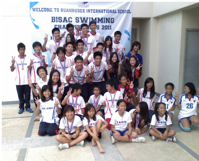
Phoenix Aquatics BISAC Swim Team 2011

We're on the Web! Come see us at: http://www.rism.ac.th/ris/ inner57.php?p=57